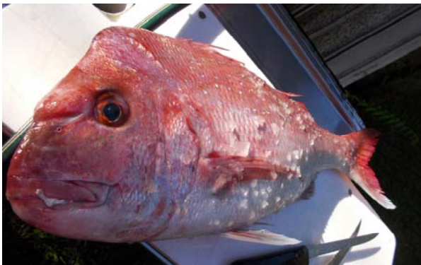
Caught 8 nice snapper in the 1-4 kg range on deep floating pillies in 60m of water on the drift. I dropped in at the Cobia wreck on the way back and latched onto a huge fish for 45 minutes which ended up being a 8ft Bull shark. I could have sworn it was a big Cobia or Cod. - Vic