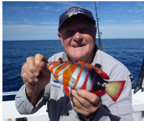
Beauty and the beast, a Harlequin Tusk Fish - Joe