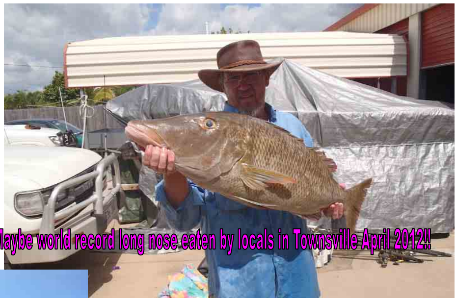
Maybe world record long nose eaten by locals in Townsville April 2012!!

As a proud sponsor of the Sunshine Coast Fishing Club, Red Energy Promotions are here to support the club and its members for any of your promotional needs. Call us on 5437 9922 or visit www.redenergypromotions.com.au for more details.